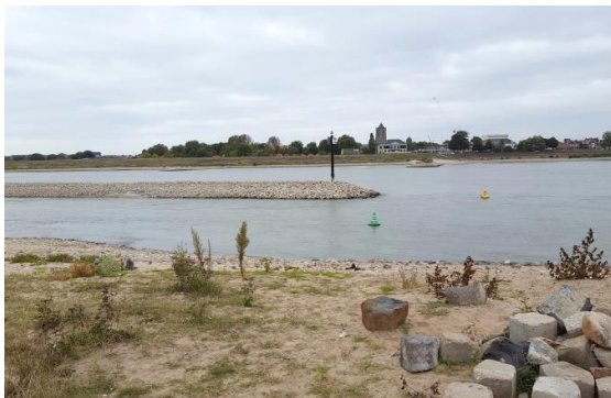
Figure 1. Longitudinal training wall in the river Waal, the Netherlands.

In a pilot project in the river Waal, longitudinal training walls have been built and the groynes have been removed, see Fig. 1. These training walls divide the flow in a main navigational channel and sheltered channel with more favourable conditions for the fluvial ecosystem (Collas et al., 2018). Due to the alignment with the river banks, training walls produce less flow blockage and resistance at high flows than perpendicular-oriented groynes. This is expected to decrease the erosive action on the river bed that is responsible for large-scale bed degradation.